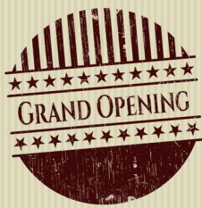
Exhibit Hall Grand Opening Tuesday | 4:00 pm Join us for some great food & drinks as we welcome our 2023 exhibitors!